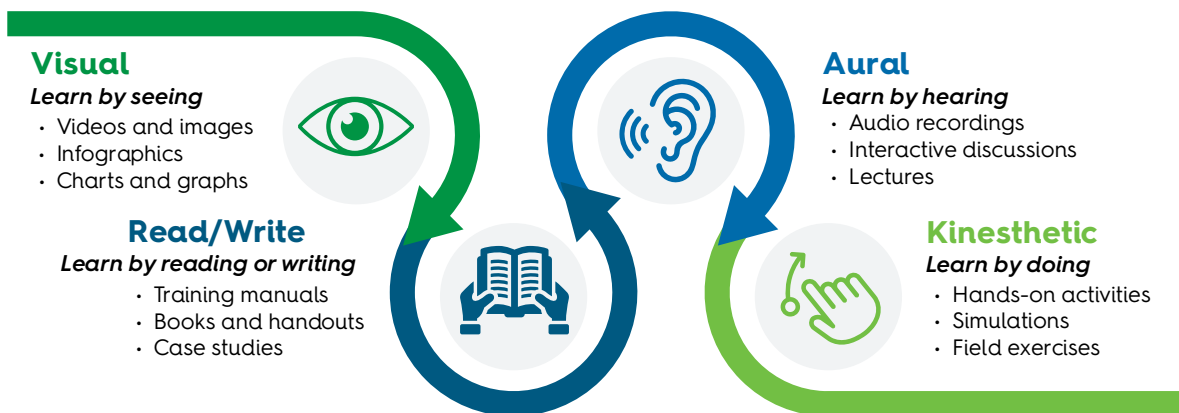
Figure 3. VARK Training Styles (Fleming & Mills, 1992)

The VARK (visual, aural, read/write, kinesthetic) questionnaire, originally developed by Fleming and Mills (1992), is amongst the most widely recognized learning style model which characterizes individuals into four main learning preferences: visual, aural, read/write and kinesthetic (see Chick, 2010). Notably, research has shown that learning styles may be fluid depending on the information being taught (Pashler et al., 2008). It is recommended that training is developed to meet all four learning styles (OSHA, 2021).