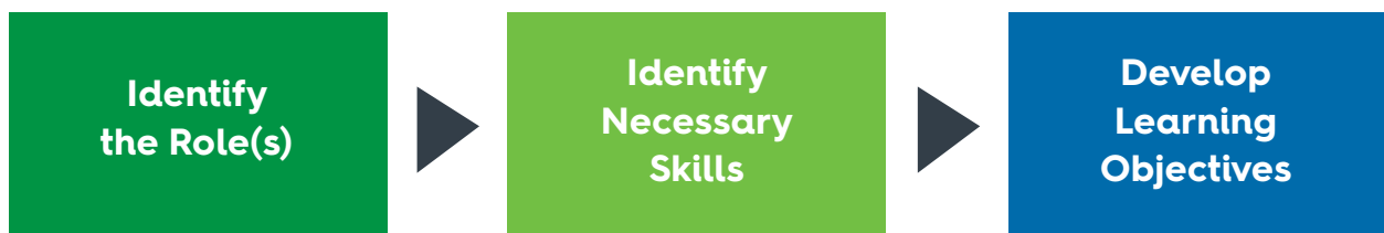
Figure 1. Dow's Needs Assessment Criteria

The Campbell Institute Training Effectiveness Workgroup reemphasized the utility of a needs assessment. According to Campbell Institute member company Dow Inc. (Dow), their approach to training development is a structured and deliberate process involving three key criteria (see Figure 1).